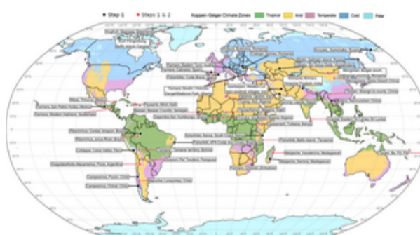
Fig 2. Selected study sites. Sites are displayed across the main different climate types defined by Köppen-Geiger [22]. Figure elaborated by the authors. Original map from the Natural Earth data set in the public domain (available from https://www.naturalearthdata.com ), elaborated with the R libraries mapproj [23] and sp [24]. https://doi.org/10.1371/journal.pone.0279847.g002

In 2019, the author team worked in the selection of sites where the protocol would be applied. Fig 2 shows the geographical location of the study sites where the protocol has been applied.